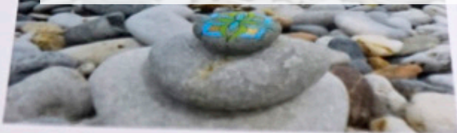
Milatos beach, Kreta - ...